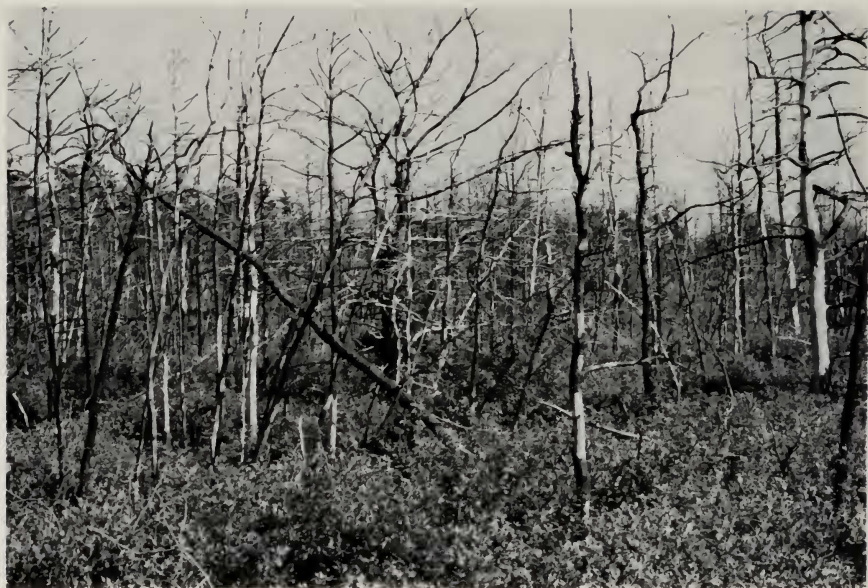
FIG. 2. The BURN study plot at the time of the study (2 years after the fire). Note that only the oak layer has regenerated and that the tree layer consists entirely of dead trees (compare Fig. 1).

Additionally, the plots differed in that: (1) the unusually dry spring of 1976 delayed the emergence of Q. ilicifolia in BURN by nearly a month (some leaves emerged from buds as early as 10 June, but most emerged between 15 and 22 June), whereas oak in REGN emerged at the normal time (20–28 May), presumably because it was protected by the shade of the live pines; and (2) the proximity (50–150 m) of the BURN to the edge of the unburned forest (Fig. 3), which consisted of large live P. rigida and Q. velutina , may have been an important factor to Prairie Warblers breeding in BURN. Oak leaves in this forest emerged normally, Q. velutina in early May and Q. ilicifolia in late May, and Prairie Warblers often foraged there.